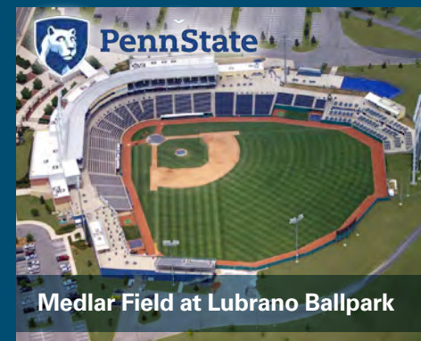
Medlar Field at Lubrano Ballpark