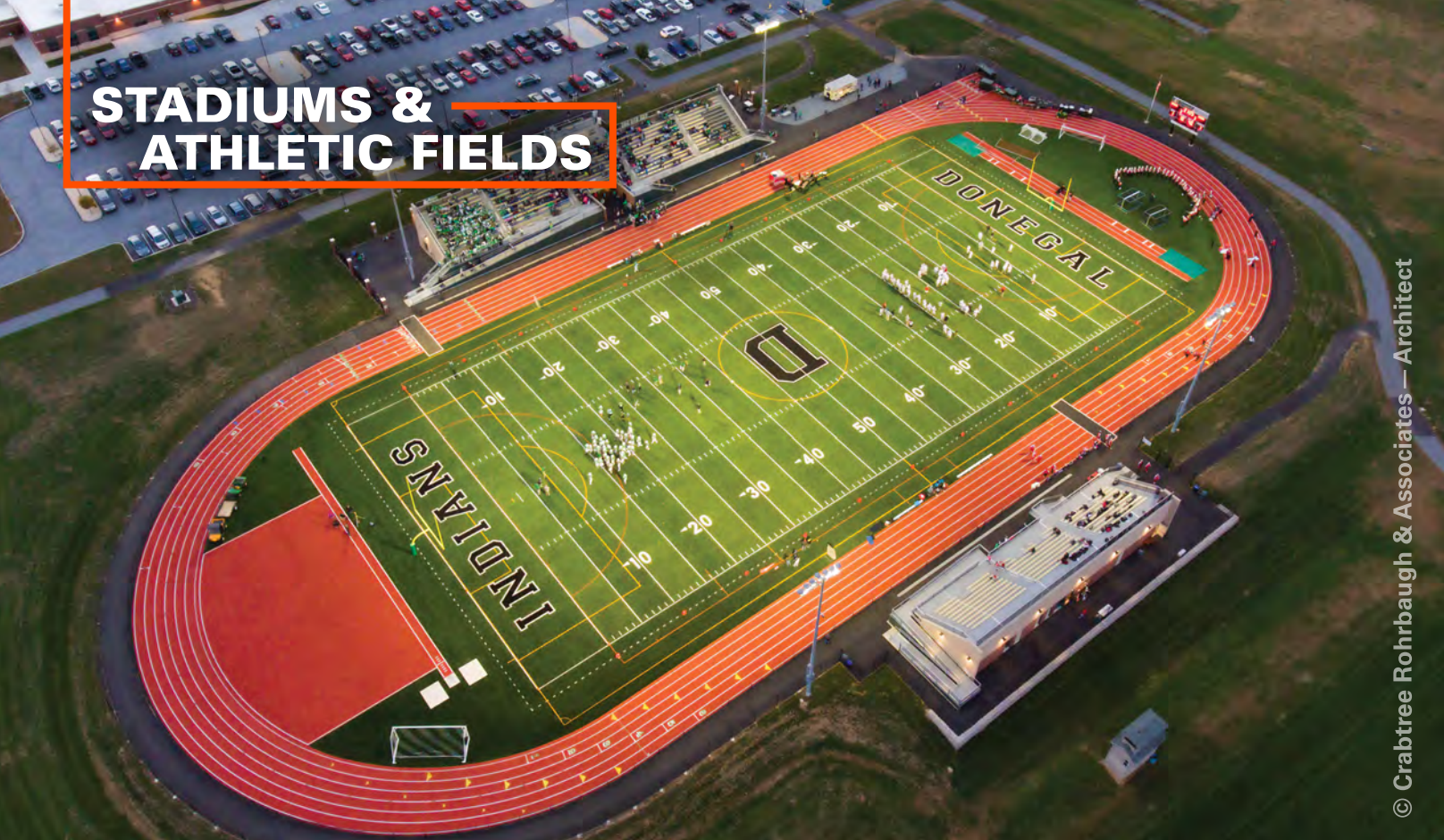
© Crabtree Rohrbaugh & Associates — Architect