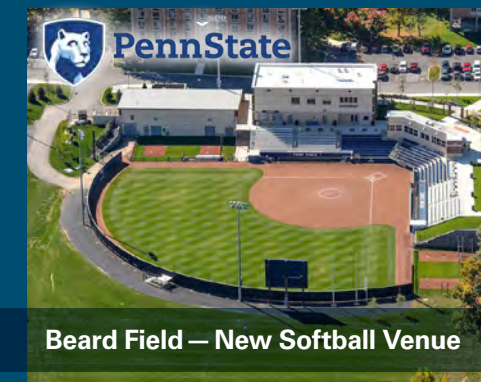
Beard Field — New Softball Venue