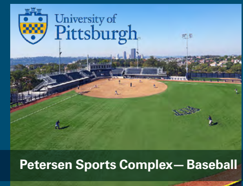
Petersen Sports Complex — Baseball